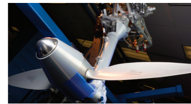
POWER & CONTROLS